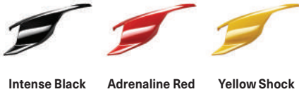
Intense Black Adrenaline Red Yellow Shock