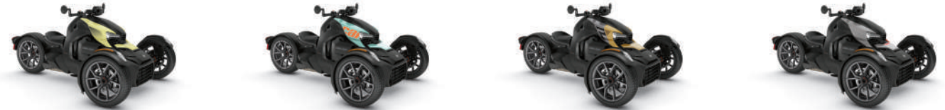
Lemon Twist Icepop Blue Gold Rush Silver Lava