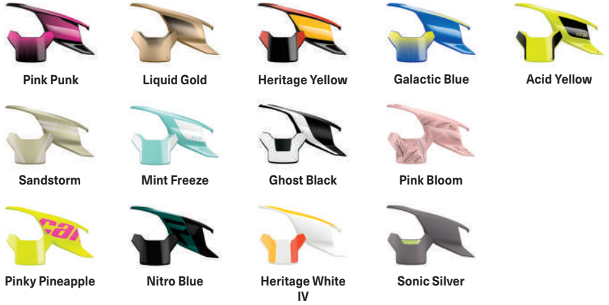
Pink Punk Liquid Gold Heritage Yellow Galactic Blue Acid Yellow Sandstorm Mint Freeze Ghost Black Pink Bloom Pinky Pineapple Nitro Blue Heritage White IV Sonic Silver